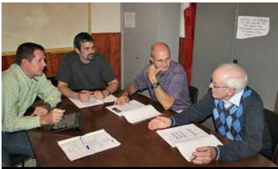
The Latin America LEAD team discuss potential places to find church planters.