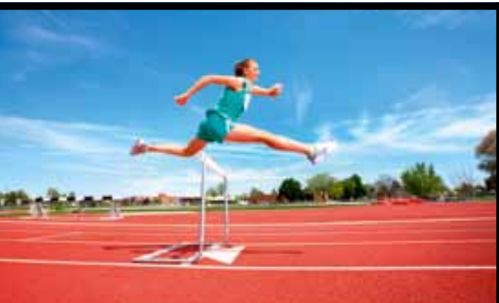
We face obstacles if we are making a difference in our communities.

Genuine Fellowship Restored. In Paul's letter to the Ephesians (2:14-16), he speaks of Christ as the barrier breaker between Jews and Greeks. God's purpose, Paul says, was to create "one new man out of the two." I was in Nazareth recently for the annual meeting of the European Baptist Federation and to celebrate the 100th anniversary of Baptist work in Israel. It was interesting to see how Arab evangelical Christians, a minority within a minority within a minority, are seeking to be salt and light in their country. At the meeting, we heard two speakers, one a messianic Israeli and another a Palestinian Arab, who work with a group called Musalaha.