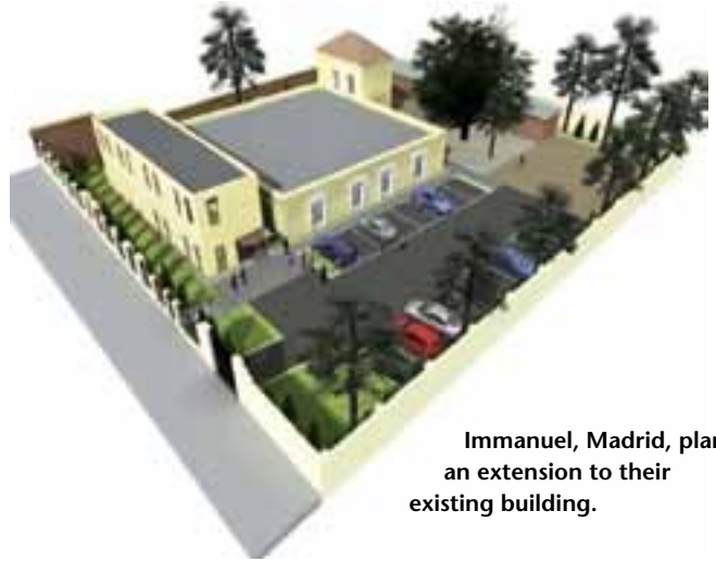
Immanuel, Madrid, plans an extension to their existing building.