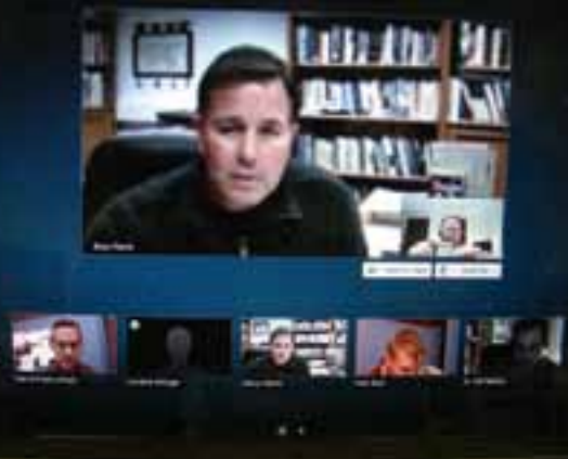
The Executive Council holds its first web-meeting.