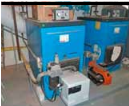
photo left: Immanuel Baptist Church, Wiesbaden, Germany, needs to replace the entire gas heating system.

Emergency Projects are projects which arise throughout the year such as disaster relief or hunger aid. ■