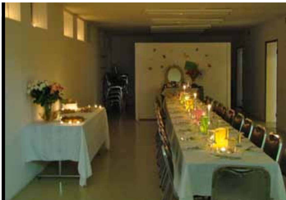
Bethel, Frankfurt's fellowship hall is transformed into a banquet hall.