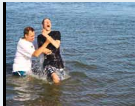
Bratislava holds a baptism service in the Danube.