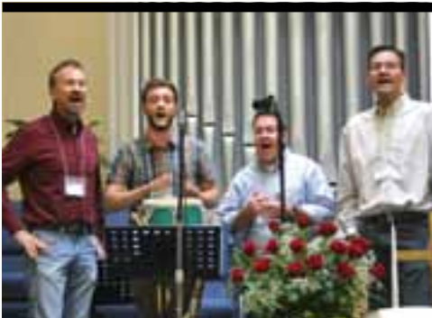
IBC's own worship leaders form the praise team.