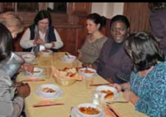
IBC Women enjoy a traditional Italian meal.

On 7 October, the Executive Council held its first web-meeting. Using software that allowed video as well as audio conferencing, the Executive Council met to discuss the recommended changes to the operations manual and constitution as well as the recommended budget and Global Missions Offering recipients. No business was conducted during this meeting as no quorum was established. ■