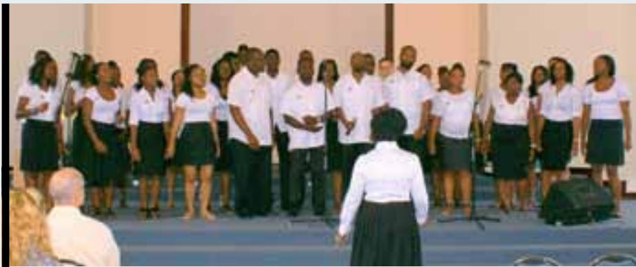
The Shiloh Gospel Choir sings at IBC San Jose.