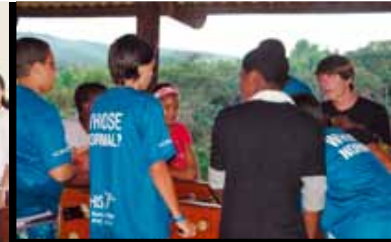
Youth enjoy activities as part of the SMASH retreat.