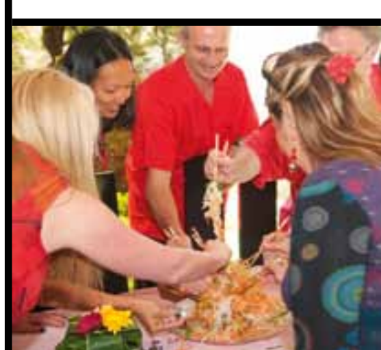
Members of IBC San Jose toss a Chinese blessing salad.