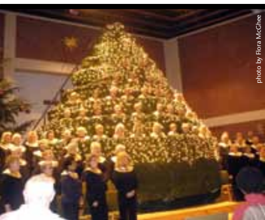
Immanuel, Wiesbaden hosts the Living Christmas Tree.