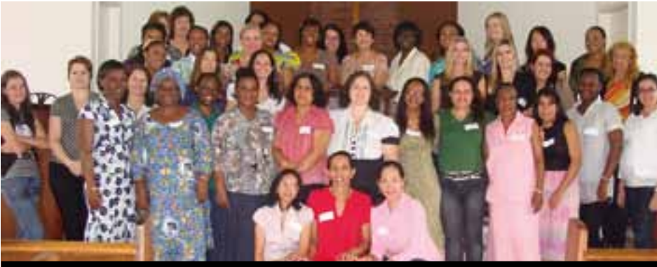
Women from 14 countries participate in IBC Brasilia's women's conference.