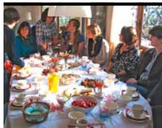
Immanuel, Madrid women meet for a coffee group.