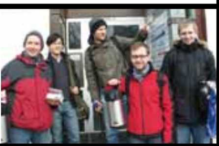
IBC Hamburg distributes coffee and sandwiches to the homeless.

The group meets alternatively on Saturday or Sunday morning, prepares coffee and sandwiches, and then goes out in pairs or groups of three, offering food and conversation to the homeless in Altona, St. Pauli, the city center, and the main train station. Although it must be added, not all of the "homeless" are without