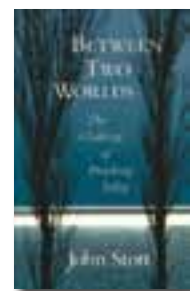
John Stott: Between Two Worlds – The Challenge of Preaching Today PB, 351 pages, ISBN: 978-0802806277

Preaching is indispensable to Christianity. Preaching is sharing God’s Word in the power of the Holy Spirit through human personality for the purpose of life change. This is true in any church in any culture. For those who weekly stand in the pulpit of an international church there are some unique challenges that come from the diverse audience that sits gazing at you when you preach. But when we recognize the unique challenges and then we make the needed adjustments, life change can happen. We can be used by God as a bridge builder between the biblical world and our diverse contemporary world. ■