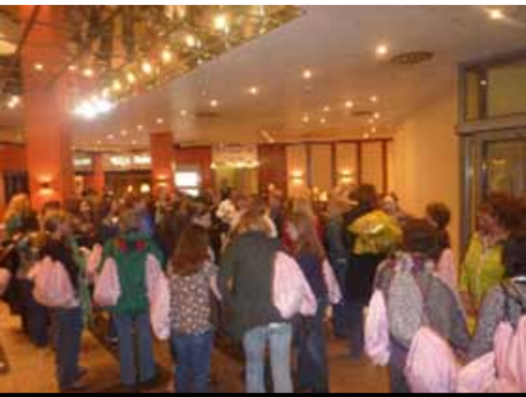
Women gather in hotel lobby before distributing gift bags to the homeless.