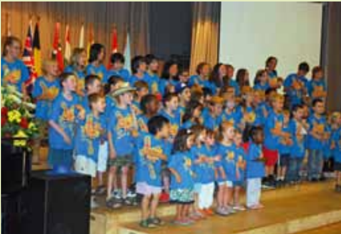
Saddle Ridge Ranch is the theme of the children's program.

Whom have I in heaven but you? And there is nothing on earth that I desire beside you. Psalm 73:25 (ESV)