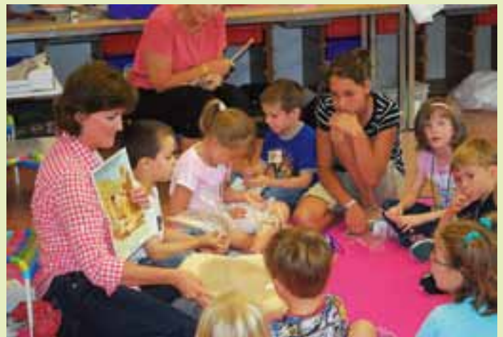
Virginia Baptist volunteers teach the children during the morning and evening sessions.