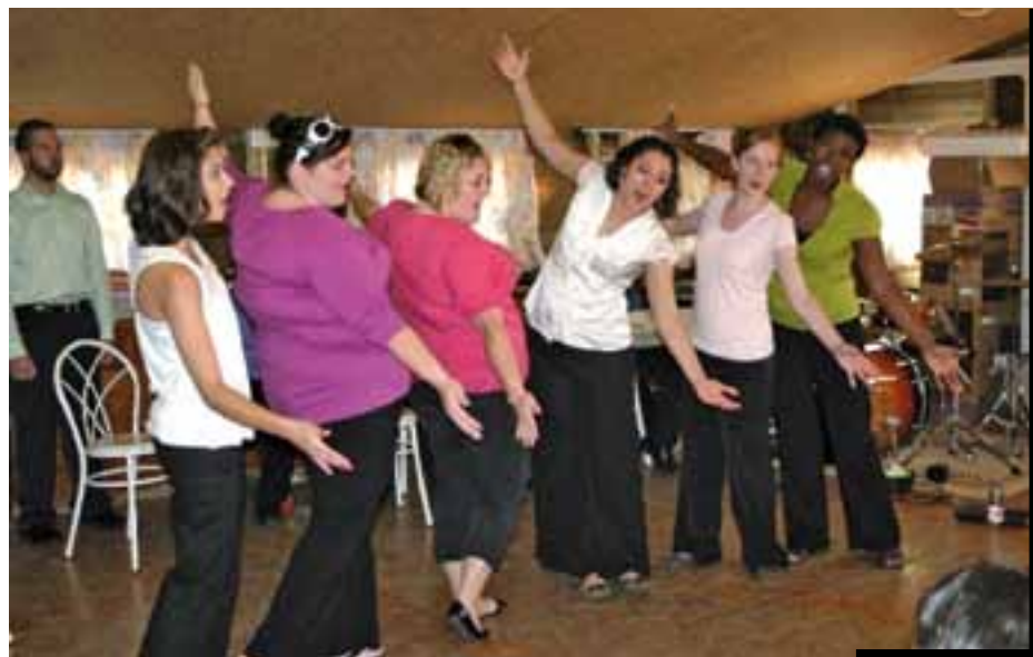
One Voice sings at a nursing home near Portimao.