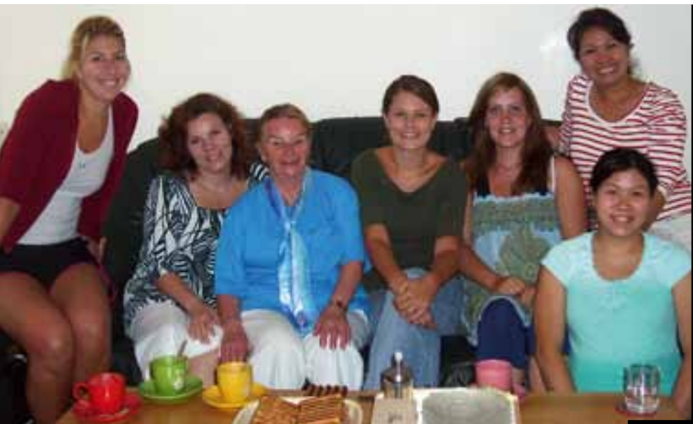
Women gather weekly for Bible study at Emmanuel, Hoensbroek.