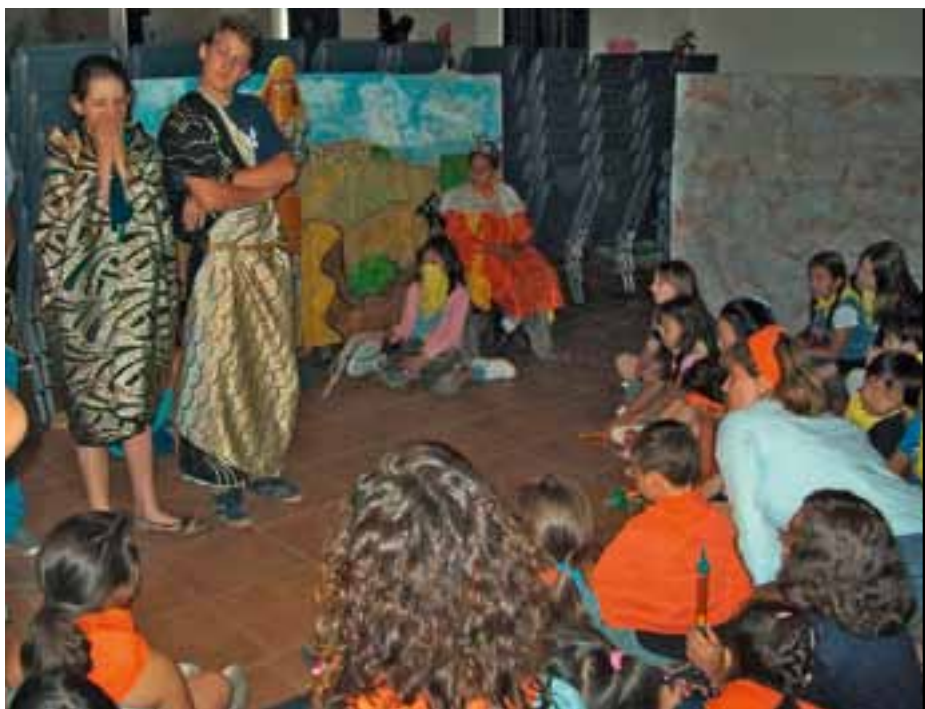
Children learn the true nature of God at the Wildwood Forest.