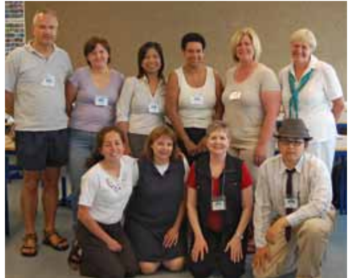
IBC members participate in children's ministry certification program.

for the Bible story, games, and art. Notice I said 'art'. I changed from a craft to more of an art experience. There is a set thing to make, but no examples and a variety of mediums to achieve the 'goal'. Again – the kids love it! They are much more interested and willing to work at their creation." ■