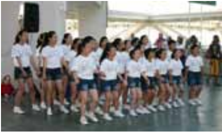
A children's choir performs in the atrium before an Evening Celebration.