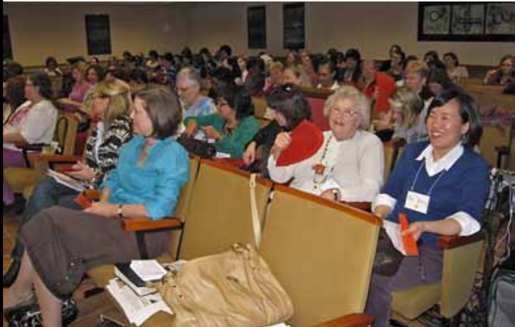
Nearly 200 women gather in Madrid to "Fan Into Flame" their gifts.