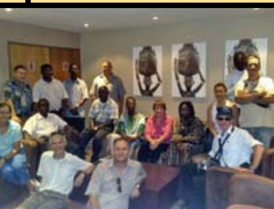
BBC leaders plan a new church start.