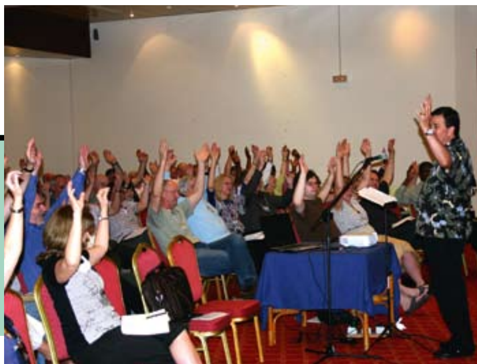
Supporting leaders: Who is holding up your hands as in Exodus 17?