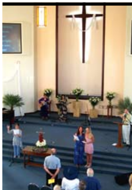
IBC, San Jose is an example of an expat congregation.