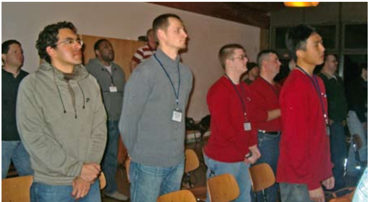
Men enjoy teaching and worship times at Lenk.

Our walk with God is not always easy, and there are going to come times when we need to suffer for Christ and we should be ready for it. We need to stay focused