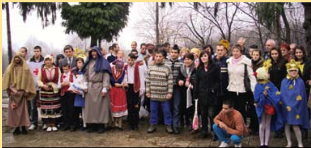
IBC, Sofia works with orphans in the area surrounding the city.

We discovered that on these mission trips of mercy perhaps the most impor-