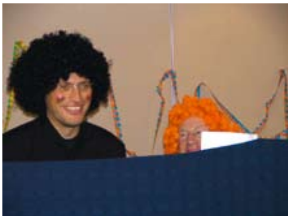
IBC, Bremen celebrates the New Year in its own way.

For IBC Bremen, past year's New Year's Eve celebrations had been rather subtle with get-togethers and private fireworks organized in the homes of some of our members. However, for the 2008 New Year's Eve Celebration, we decided to create an opportunity to celebrate the new beginning with the entire church family.