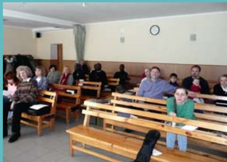
Special events like this baptism make for a busy spring at Living Vine Baptist Church in Kiev, Ukraine. Worship times are a regular part of their ministry as well.