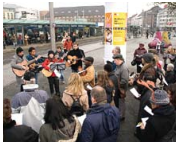
Carol singing attracts a crowd in Bremen.

delicacies from our home countries. It was a great delight to see how many dishes were presented in our unique congregation. Apart from the family spirit that was experienced in our church kitchen, it was also very interesting to witness the rather interesting looks of members as they combined and tasted the different dishes.